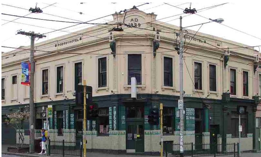
The Rob Roy Hotel, before its change to the present Workers Club Hotel